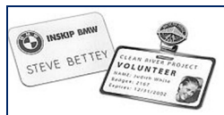
Present Your ID Badge

Just show your school ID Badge as proof of your employment to start receiving discounts from participating businesses. Be sure to check each listing for any special requirements. Each business will also have the Fauquier County Public Schools Seal displayed in their window.